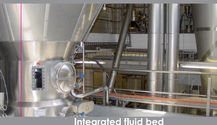
Integrated fluid bed